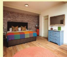
The Eastbury in Dorset (shown above) has just added five new Potting Shed Suites in the garden as well as opening a small, but perfectly formed new spa.

Autumn 2020 sees 72 Riad Living in Marrakech adding a large restaurant as well as a stunning new spa which will boast a very large pool, a second rooftop pool and a second sky bar. There'll also be a double hammam, three massage rooms, relaxing area and Jacuzzi, the perfect winter spa retreat.