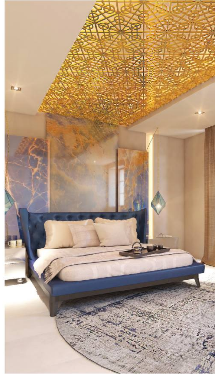
Right: One of the bedrooms at La Perla and below right, Paragon 700

La Perla Hotel Boutique has been a while in the making and could well be the opening of the year. No expense has been spared in the renovation of