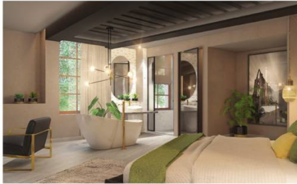
The opening of the year? The stunning La Perla Hotel Boutique