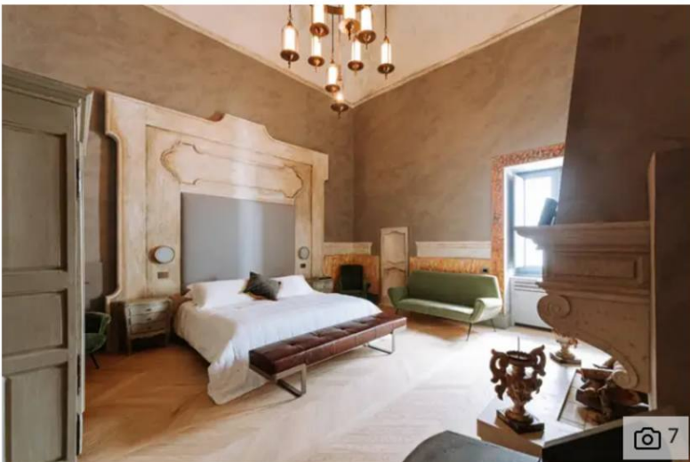
Traditional techniques have been employed to restore period features and finishes (Paragon 700)