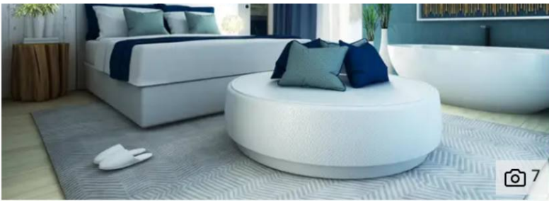
The latest Tuscan opening has a green and blue colour palette (The Sense Experience Resort)

Arriving in Tuscany's Maremma is a 112-room hotel, which takes heavy inspiration from its rugged natural surroundings. Ringed by 12 acres of parkland, thick with centuries-old trees, sandy dunes and bordering the Tyrrhenian Sea, the property's green and blue colour palettes mirror the pineland and ocean waves.