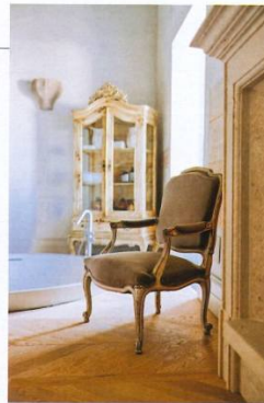
STAY AND TAKEAWAY Guests at Paragon 700 in Puglia can buy furniture that is on show in the 18th-century palazzo

A 10-minute stroll away is La Mercantaria, a vaulted 'curiosity shop' selling everything from earthenware to rocking horses. Just outside town in Carovigno, Vineria 'I Buongiorno' sells amazing local wine, olive oil and ceramic tableware. An hour up the coast in Bari is the vast Antonio d'Erasmus home and garden store, for earthy, Indonesian-style