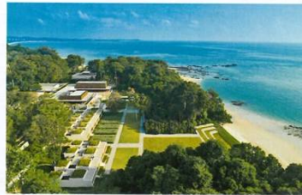
WATER FEATURES One&Only Desaru Coast offers both an infinity pool (far left) and an extended stretch of pristine beach