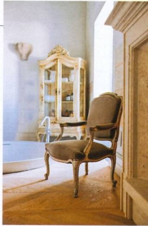
STAY AND TAKEAWAY Guests at Paragon 700 in Puglia can buy furniture that is on show in the 18th-century palazzo

A 10-minute stroll away is La Mercantaria, a vaulted 'curiosity shop' selling everything from earthenware to rocking horses. Just outside town in Carovigno, Vineria 'I Buongiorno' sells amazing local wine, olive oil and ceramic tableware. An hour up the coast in Bari is the vast Antonio d'Erasmus home and garden store, for earthy, Indonesian-style