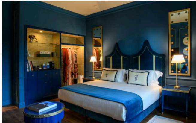
Il Tornabuoni's location in a former palace is the perfect place to base yourself for a city break in the cradle of the Renaissance