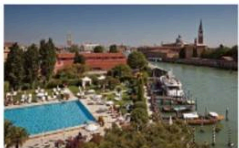
Belmond Hotel Cipriani Giudecca, Venice, Italy