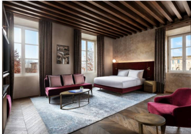
Tuscany's tower-filled Lucca welcomes a new hotel this year