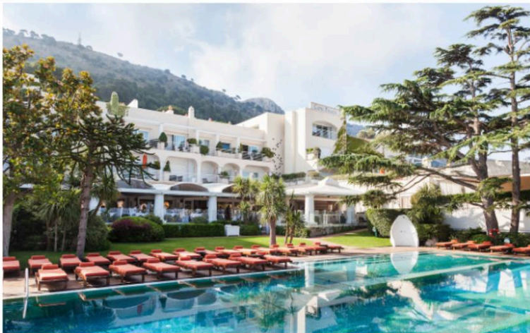
The classic Capri Palace has undergone an extensive – but sensitive – refurb by Jumeirah