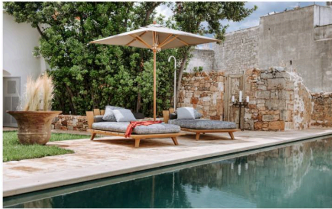
Paragon 700 is located in a former palace in Ostuni's walled city