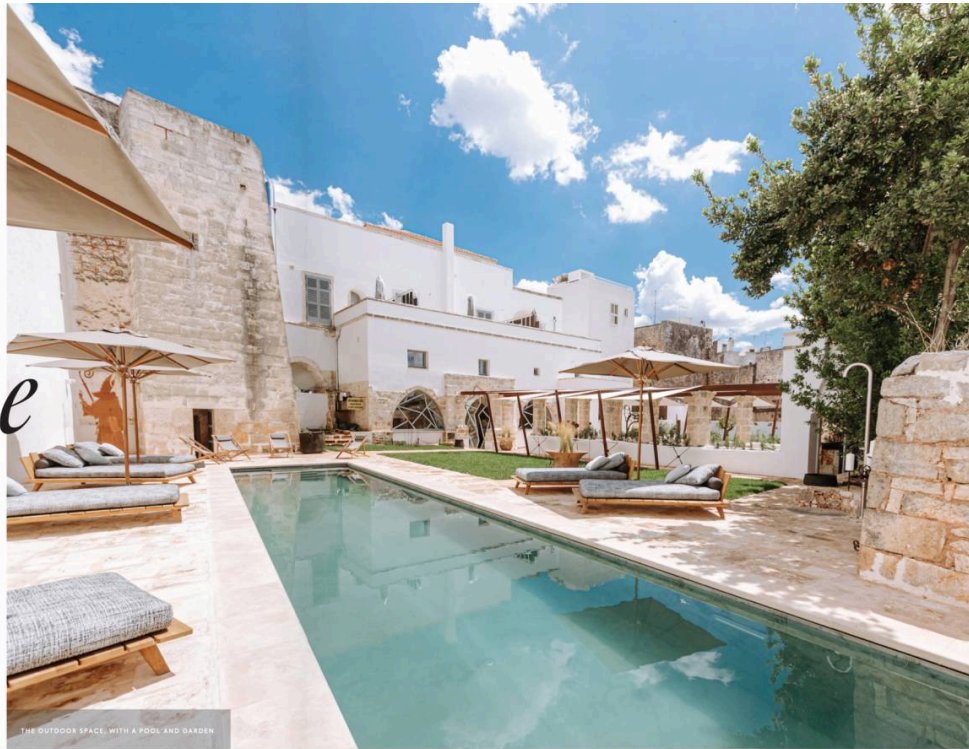
THE OUTDOOR SPACE, WITH A POOL AND GARDEN

Boutique Design Magazine (Circulation 15,000; Points 9) Spring 2021