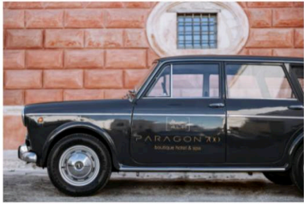
Paragon 700's vintage car sits on the piazza directly in front of the palazzo.