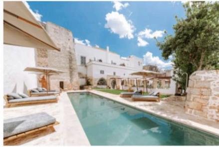
The pool area at Paragon 700.