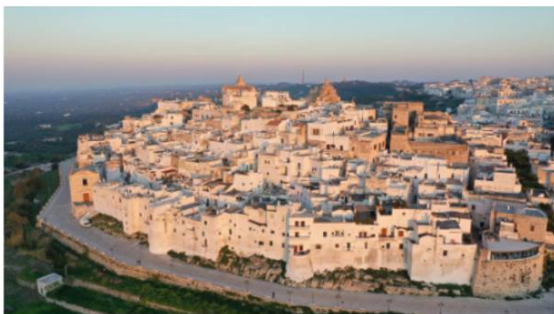
Ostuni, Puglia's "White City."

See and Do: With its turquoise waters, limestone cliffs, olive groves, and many an old masseria (farmhouse),