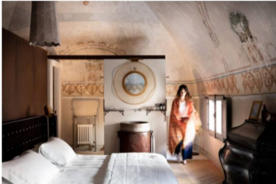
A guest room at Paragon 700, in Puglia.

With its vaulted brick ceilings, the 18th-century dining room (formerly an olive press) within the whitewashed, 40-room Masseria San Domenico serves traditional Puglian dishes such as orecchiette with cime di rapa (broccoli rabe) made using the house's own olive oil and vegetables grown on site.