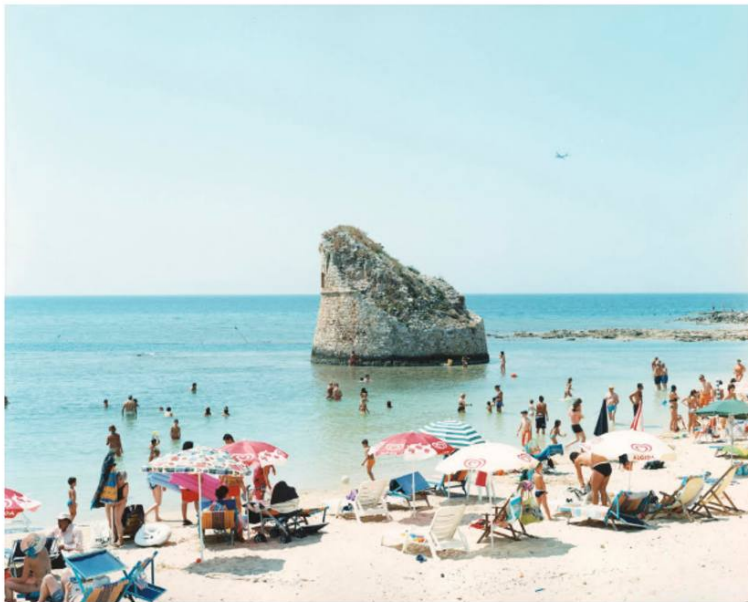
Massimo Vitali, Torre Palì, Puglia (2010).

In Partnership With NetJets, August 30, 2021